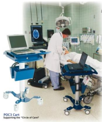
POC3 Cart Supporting the "Circle of Care"